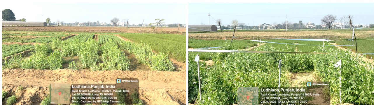
Fig. 1 An overview of field screening of AVT-II field pea entries for symbiotic efficiency with native rhizobium at Ludhiana