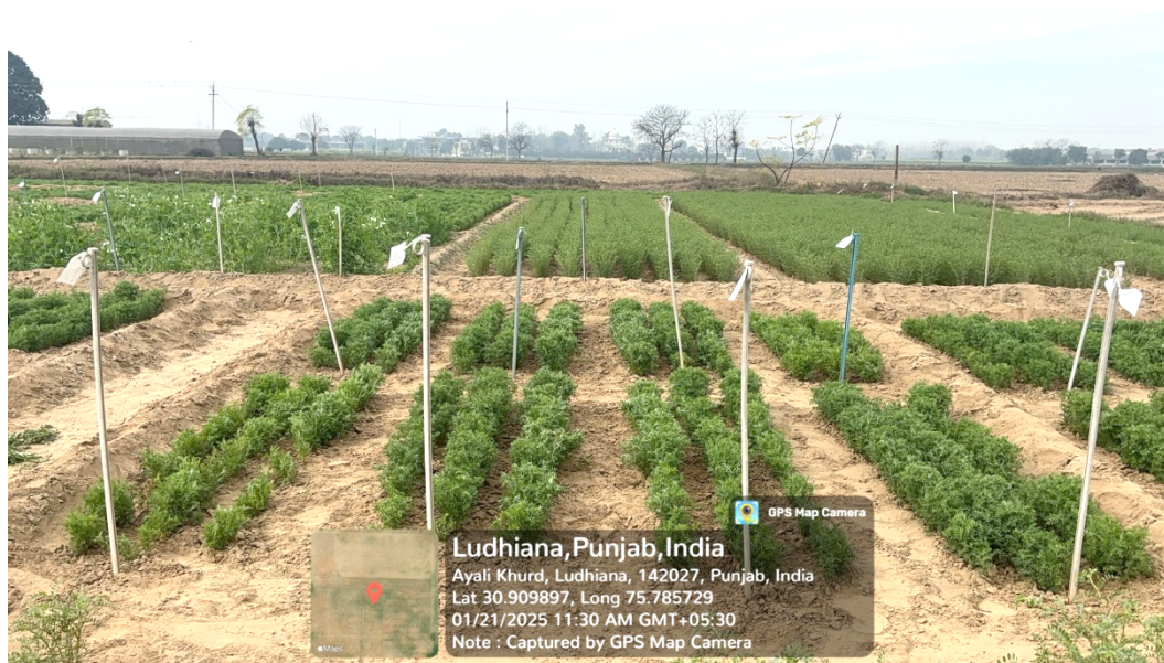
Fig. 2 An overview of field screening of AVT-II lentil entries for symbiotic efficiency with native rhizobium at Ludhiana

Four lentil genotypes (2 check and 2 test entries) were tested for symbiotic efficiency with native soil rhizobia at Ludhiana and Sehore centres. Observations on nodulation, leghaemoglobin content and dehydrogenase activity in the rhizosphere soil was recorded at 50% flowering stage. At Ludhiana, Highest nodule number (16.2 nodules/plant), nodule dry weight (21.62 mg/plant), root dry weight (0.21 g/plant) and shoot dry weight (2.86g/plant) was observed in check variety PantL11. Leghemoglobin content was found highest (2.08 mg/g of nodule fresh weight - NFW) in test variety LL1809. No significant variation was observed with respect to dehydrogenase activity (Table 2, Fig. 2).